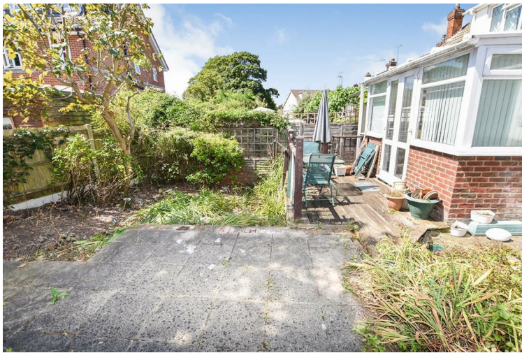
Fenced boundaries, paved patio area, wooden shed.