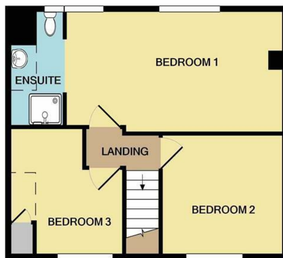
1ST FLOOR APPROX. FLOOR AREA 438 SQ.FT. (40.7 SQ.M.)

TOTAL APPROX. FLOOR AREA 1262 SQ.FT. (117.3 SQ.M.)