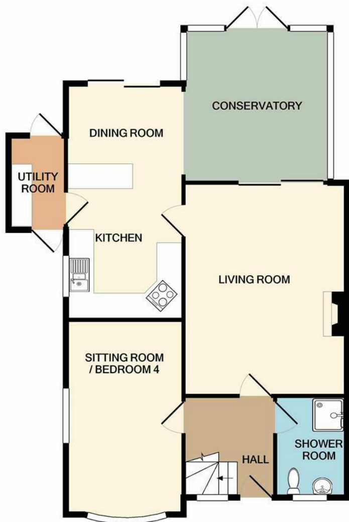
GROUND FLOOR APPROX. FLOOR AREA 824 SQ.FT. (76.6 SQ.M.)